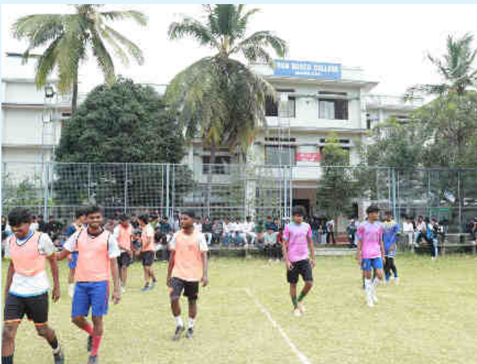
SPORTS AND RECREATION: