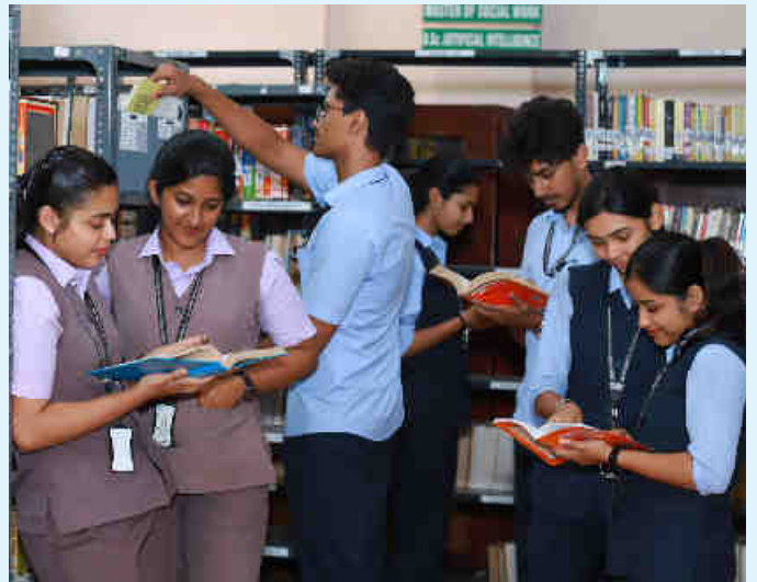
LIBRARY AND LEARNING RESOURCES